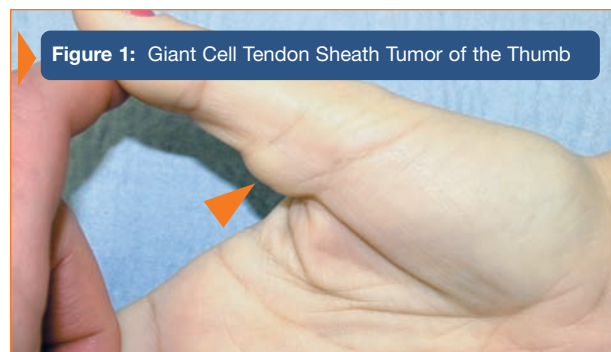
Figure 1: Giant Cell Tendon Sheath Tumor of the Thumb

Some patients may choose to do nothing and simply live with the tumor once they learn that it is probably benign. Typically, however, tumors get bigger with time and can become more of a nuisance. Patients should also consider the risks, benefits, and consequences if choosing not to have surgery. Hand surgeons can provide information and advice to allow patients to make the best decisions regarding their treatment plans.