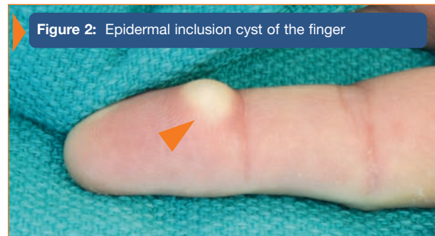
Figure 2: Epidermal inclusion cyst of the finger